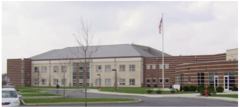
Olentangy High School, Powell, Ohio New standing seam metal roof system.