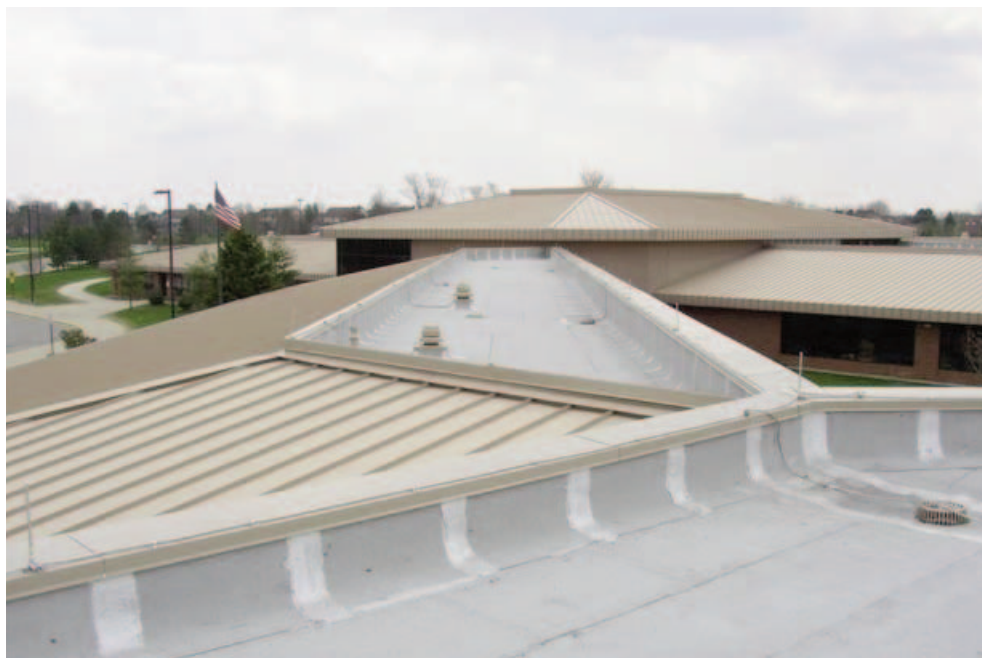
Grizzel Middle School, Dublin, Ohio Modified asphalt granular surface roof system.