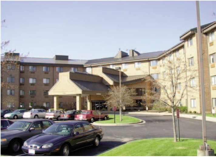
Sycamore Glen Retirement, Miamisburg, Ohio New standing seam metal roof system after existing metal roof was removed.