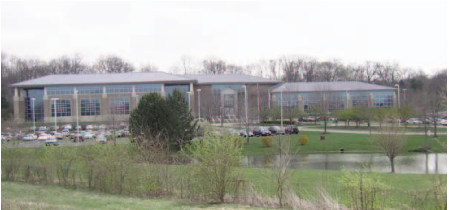
Marathon Oil Headquarters, Enon, Ohio Standing seam metal roof system.