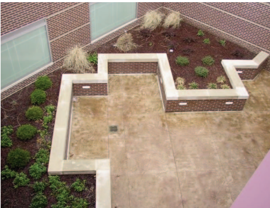
Summit Health Care, Cincinnati, Ohio Butyl rubber membrane water proofing system.