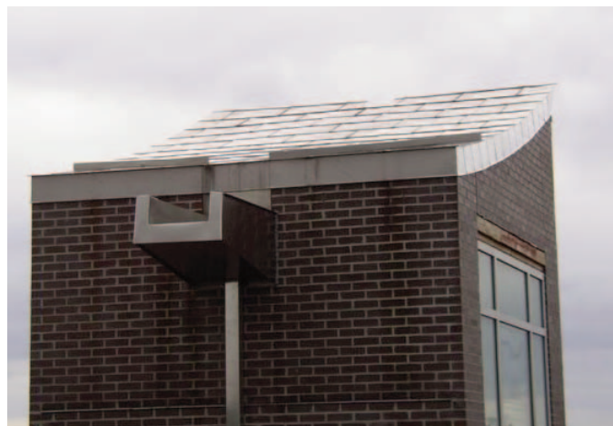
Summit Health Care, Cincinnati, Ohio Stainless steel flat seam metal roof and trim.