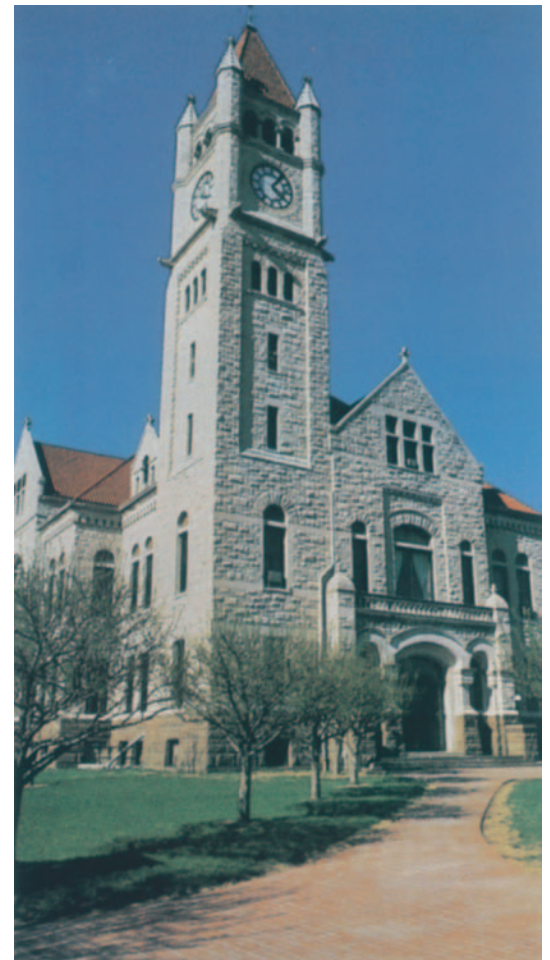
County Court House, Xenia, Ohio Twelve year old masonry restoration project involving cleaning, tuckpointing, and sealing of building following extensive tornado damage.

A full line of masonry restoration services is available to renew the beauty of your building and increase its lifespan. We remove hydrocarbons and other damaging chemicals, tuckpoint loose and deteriorating mortar joints, caulk perimeter of building openings, and completely check and re-caulk wall flashings and flashing reglets to restore buildings to a "like-new" condition.