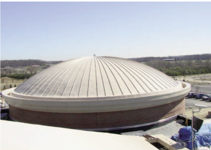
Miami Valley Medical Center, Centerville, Ohio Adhered reinforced P.V.C. system with PVC extruded ribs to simulate a standing seam metal roof.