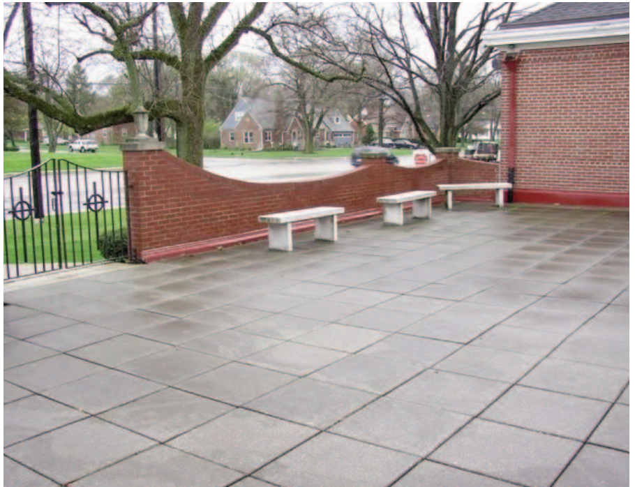
Fairmont Church, Kettering, Ohio Hot applied rubberized asphalt water proofing system.

The Harold J. Becker Company is on the leading edge of the dramatic advances in the waterproofing and dampproofing industry. We offer expert advice and the best quality products to insure dry, serviceable buildings and maximum usage per square foot.