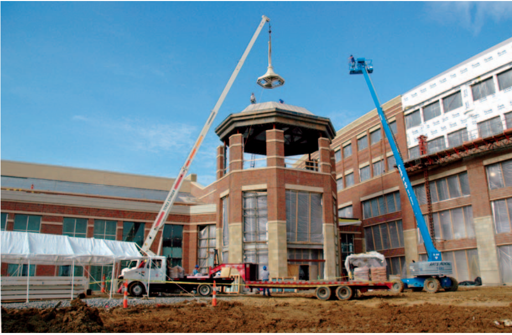
Miami Valley Medical Center, Centerville, Ohio Our crews installing a prefabricated aluminum cupola.