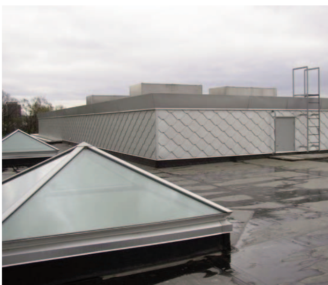
Summit Health Care, Cincinnati, Ohio Epdm low slope roof and aluminum flat seam wall panels.