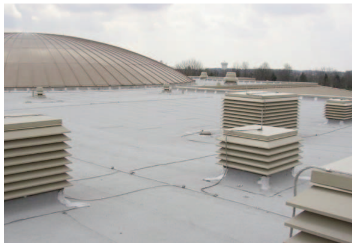
Grizzel Middle School, Dublin, Ohio Modified asphalt granular surface roof system.