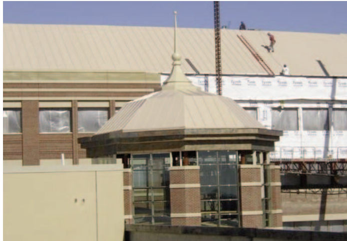
Miami Valley Medical Center, Centerville, Ohio The finished installation of cupola.