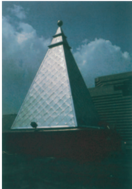
Norwick Hotel, Columbus, Ohio Flat seam Terne coated stainless steel roof system.

Specially sheet metal jobs often require as much attention to appearance as they do to function. The beautiful lines of fine architecture or interior design require skilled hands of experienced sheet metal professionals to achieve the desired results. Let our knowledge, skill and experience help to enhance or maintain the integrity of your new or existing design.