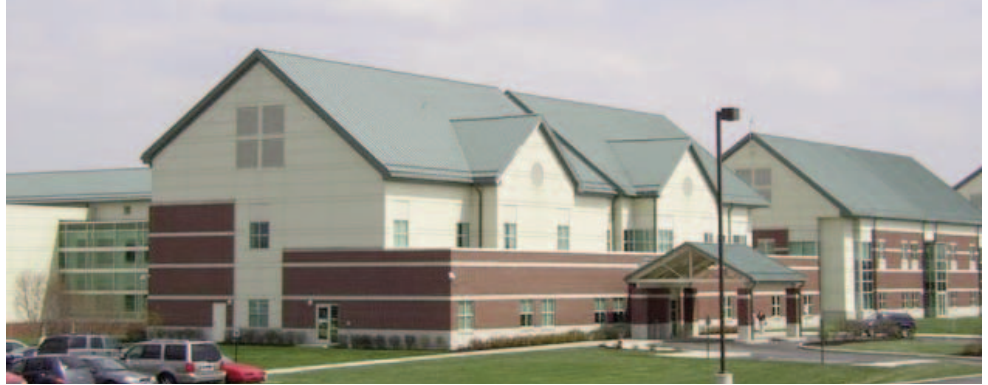
Upper Valley Medical Center, Piqua, Ohio Standing seam metal roof system with kynar color coating.

Huntington National Bank Building, Columbus, Ohio. Method of elevating precast concrete units by use of EPDM rubber pedestal.